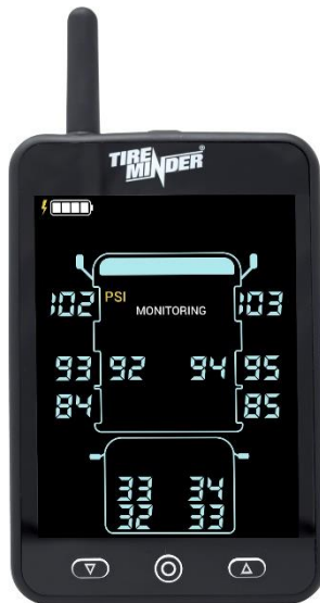
Motor Coach with Tag and Tow 12 Tires