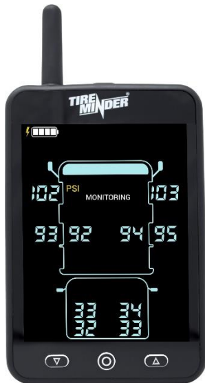
MotorHome and Tow Car 10 Tires

The AIAS has the ability to display up to 22 tires, simultaneously. As it is unlikely you will use all 22 positions, below you will find some recommendations of where to add tire positions. Ultimately, it is up to you to decide how you would like the AIAS to look. So have fun with it!