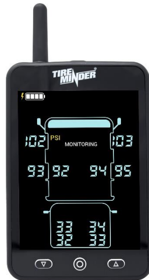
Dually Truck and 5 TH Wheel 10 Tires