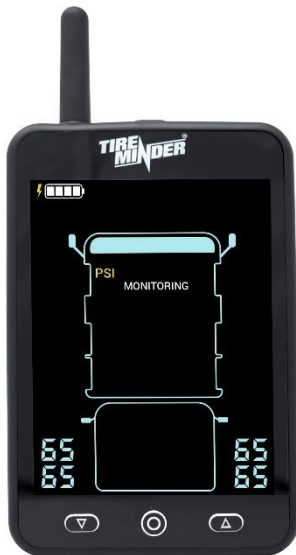
5 TH Wheel 4 Tires